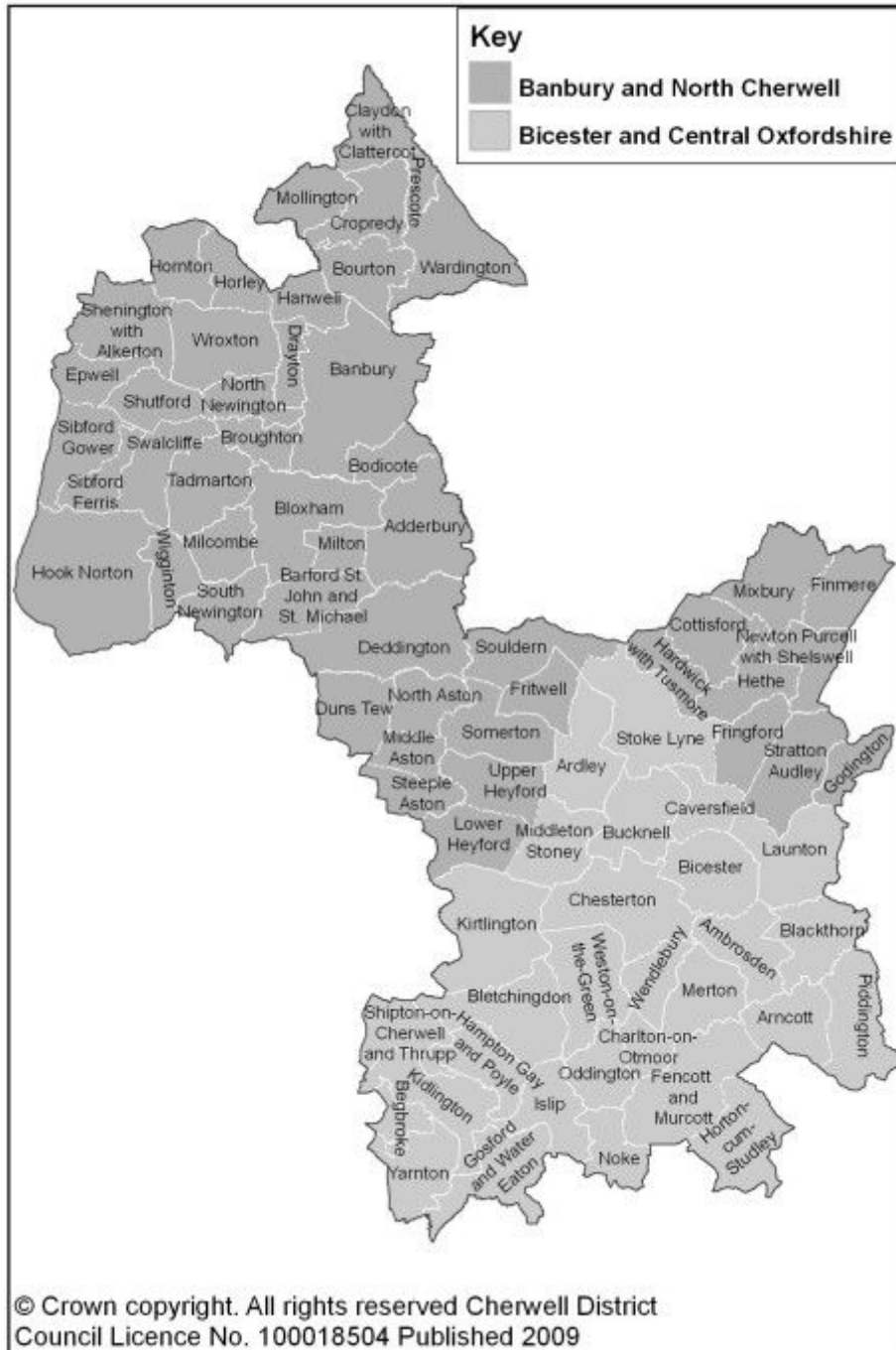
Figure 1 Banbury and North Cherwell and Bicester and Central Oxfordshire Area Boundaries